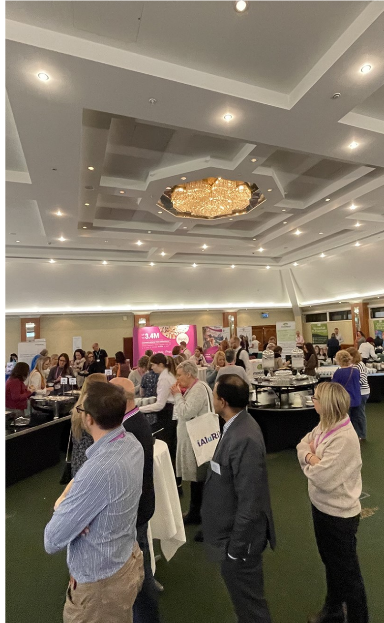
BHUK Exhibition Hall